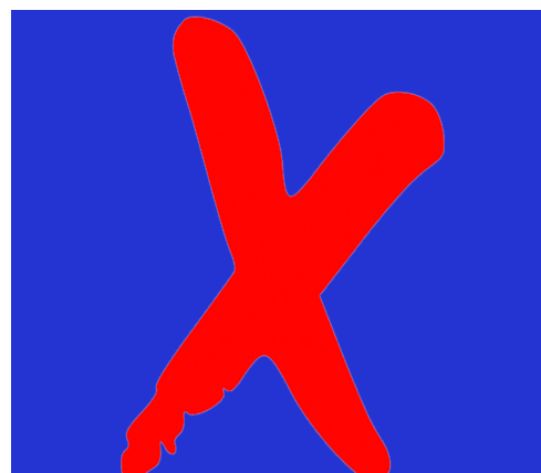
Old College Color Royal Blue