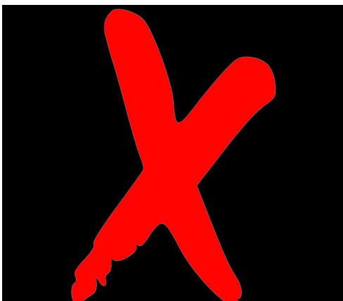
Old College Color Black